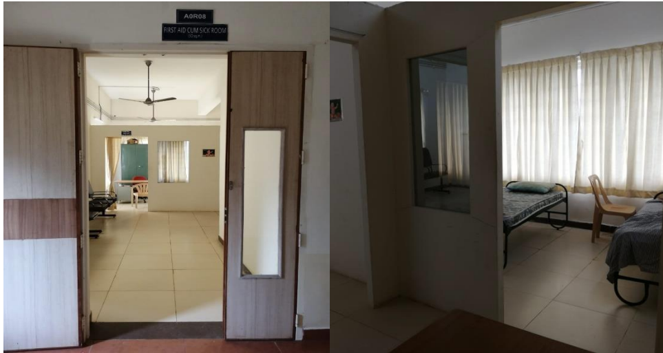
First aid and Common Room for students